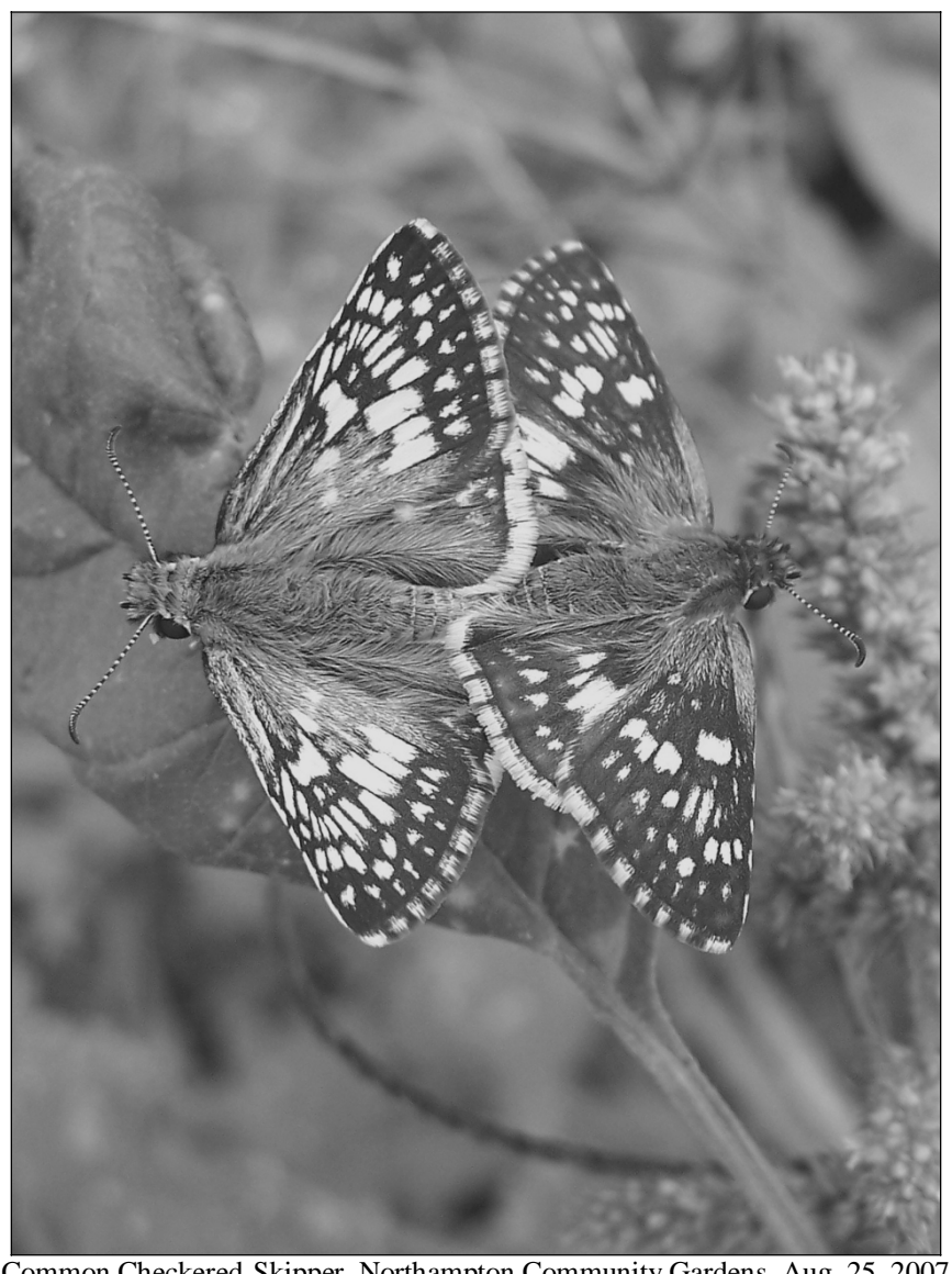
Common Checkered-Skipper, Northampton Community Gardens Aug. 25, 2007