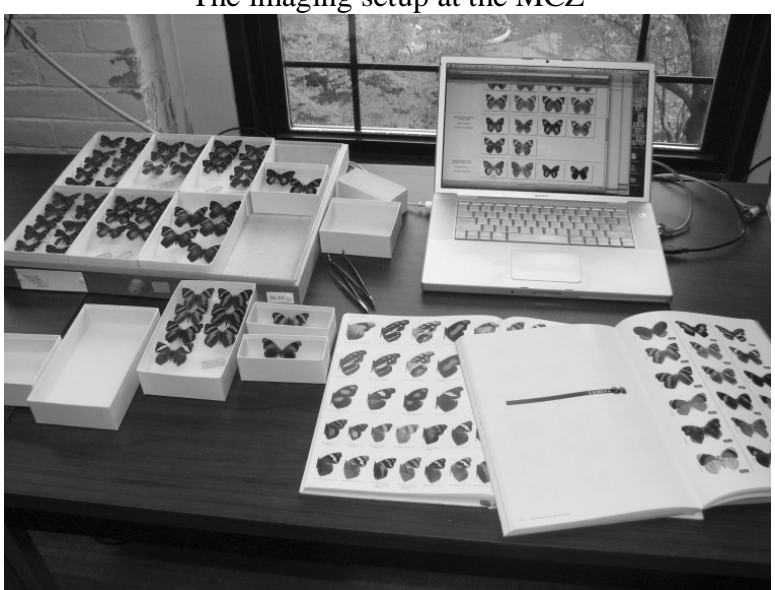
The hard work of identifying the specimens