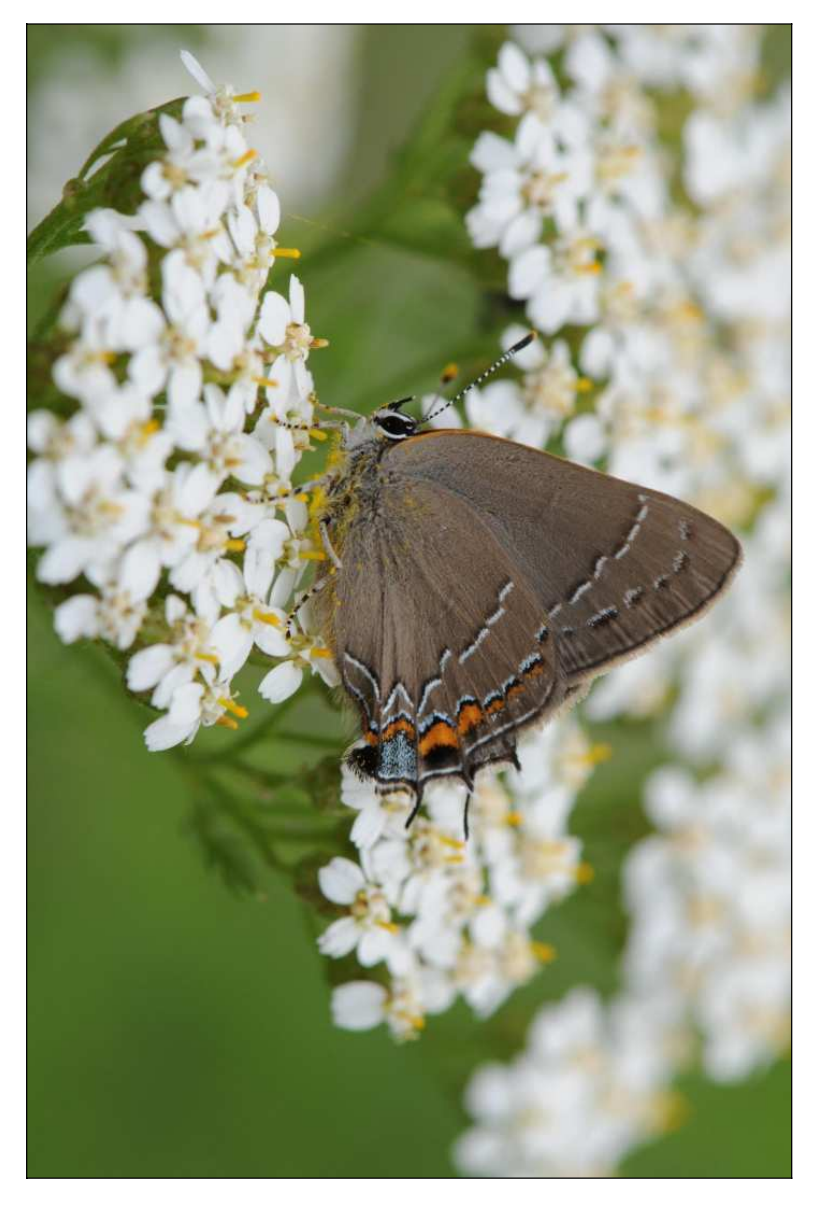
Oak Hairstreak, Great Blue Hill, Canton. June 26, 2011.

Massachusetts Butterflies No. 38, Spring 2012 ©Copyright 2012 Massachusetts Butterfly Club. All rights reserved.