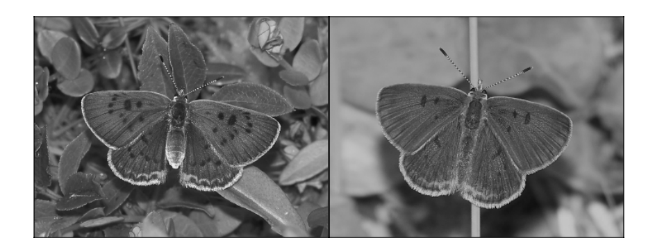
That's the female on the left. In addition, her color (no purple highlights) and pattern (more extensive dots) differ from those of the male.

Finally, let's turn to "sexual chemistry". The males of a number of species have scales on their wings that release pheromones to attract females. In the ever-popular Monarch, they are in the form of a dark spot on the vein closest to the body on the hindwing, most easily seen from the dorsal side. Males have 'em; females do not. Also note that the black wing veins are thicker on the female (on left).